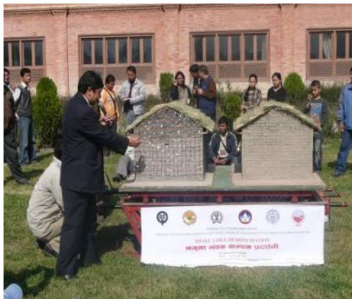
Fig 3.6 Two identical buildings with and without retrofitting by PP Band before shake table

In order to demonstrate the seismic response of the target building, with and without PP-band mesh retrofitting, and to compare crack patterns, failure behavior, and overall effectiveness of the retrofitting technique, a shake table test was carried out. The test verified that PP-band mesh retrofitting significantly improves the performance of the masonry building structures, maintaining the structural integrity with sufficient energy dissipation through extensively developed cracks [NSET, June 2009]. The general process of retrofitting by PP Bands includes 1) Plan modifications such as adding or removing solid walls, changing door/window openings, if required, to balance wall stiffness in both directions 2) Chipping off the wall plaster 3) Fixing of base anchor beam and tying on either side of the wall 4) Fixing of vertical PP Band starting from the outer anchor beam and ending at the inner anchor beam (this is feasible with flexible timber flooring) 5) concreting of anchor beam 6) Meshing the horizontal PP band on vertical PP band then connecting horizontal PP-Band with vertical PP-Band by Welder 7) Connecting inner and outer mesh with wires and aluminum plates 8) connecting roof elements with wall and bracing of roof 9) Mud plaster on wall to protect PP Band from ultraviolet rays.