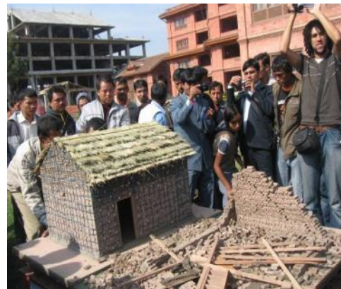
Fig 3.7 Shake table result' Non-retrofitted building collapse while retrofitted building is standing