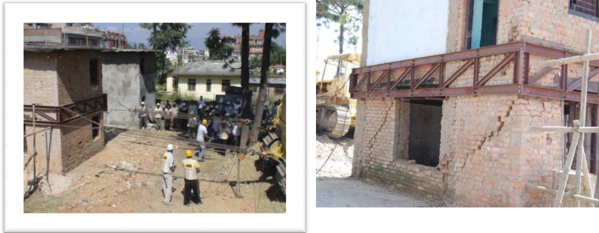
Fig 3.2 Loading arrangement (left) and crack propagation (right) during pull down test of non-retrofitted building