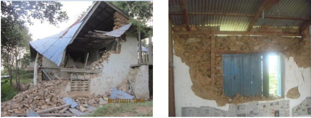
Fig 2.2 Failure of roof connection to wall (left); Collapse of inner wythe of stone wall due to lack of through stone (right), 18th Sept 2011 Taplejung Nepal earthquake, Photo courtesy NSET