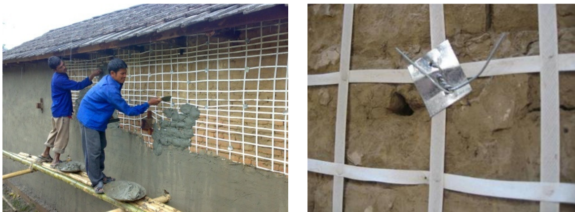
Fig 3.5 Implementation of PP band method of retrofitting in Kathmandu Valley (left) and anchorage throughout the wall (right)

A pilot scheme implementing the PP-Band technology in Nepal was conducted in a rural village just outside Bhaktapur, in Nepal, by National Society for Earthquake Technology-Nepal (NSET) in collaboration with Mondialogo Engineering Award Team. The project is titled 'Improving the Structural Strength under Seismic Loading of Non-Engineered Buildings in the Himalayan Region' and outlines training courses for rural masons and public demonstrations for community members in the seismically active Himalayan region, to promote seismic resistant building and retrofitting techniques, focusing on polypropylene meshing. The main objective of the project is to disseminate and transfer the PP-band retrofitting technique to the communities who cannot afford other expensive retrofitting technology. The masons were trained through hands on implementation, found to be technically feasible and easily implemented.