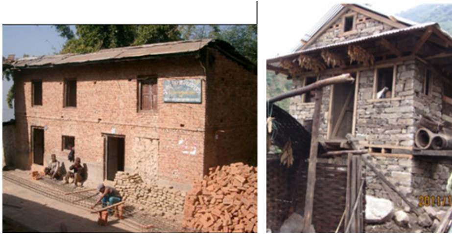
Fig 1.1 Typical brick (left) and stone (right) masonry buildings in Nepal