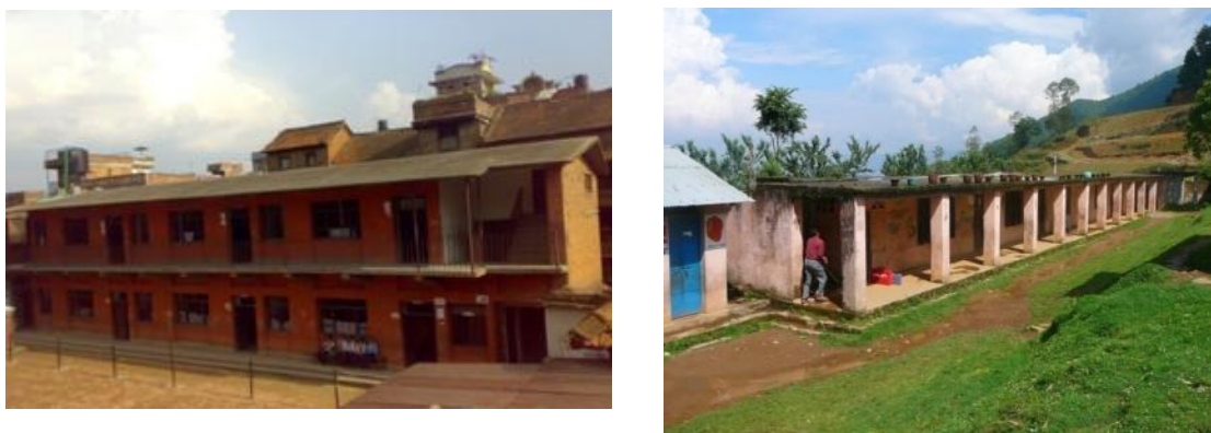
Fig 3.3 Two of the school buildings before retrofitting