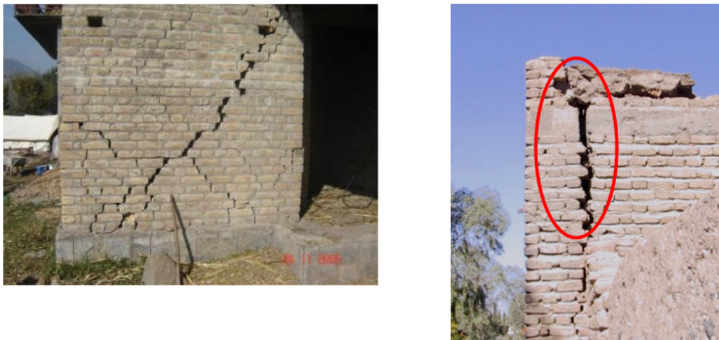
Fig 2.1 Diagonal shear failure, (left); Corner separation due to lack of integrity (right), 2005 Pakistan earthquake

The damage and destruction in stone and brick masonry walls is attributed to the violation of the most basic rules of masonry construction, such as the absence of ‘through’ stones and ‘long corner’ stones in stone walls, use of mud mortar/lean cement mortar in stone or brick masonry, lack of proper connection between orthogonal walls or between the roof and walls, lack of proper workmanship and quality control, lack of cross walls and above all, the absence of earthquake resistant features, causing the building to fail in a brittle manner rather than in a ductile manner. A large number of masonry buildings suffered severe damage through past earthquakes, indicating the high level of seismic vulnerability in the region . The most common damage patterns are corner separation, formation of cracks near the corners and at openings, out-of-plane tilting of walls, collapse of roof etc. Improvement in construction practice and maintaining the integrity of the building structure, can significantly enhance the earthquake resistant performance of such buildings.