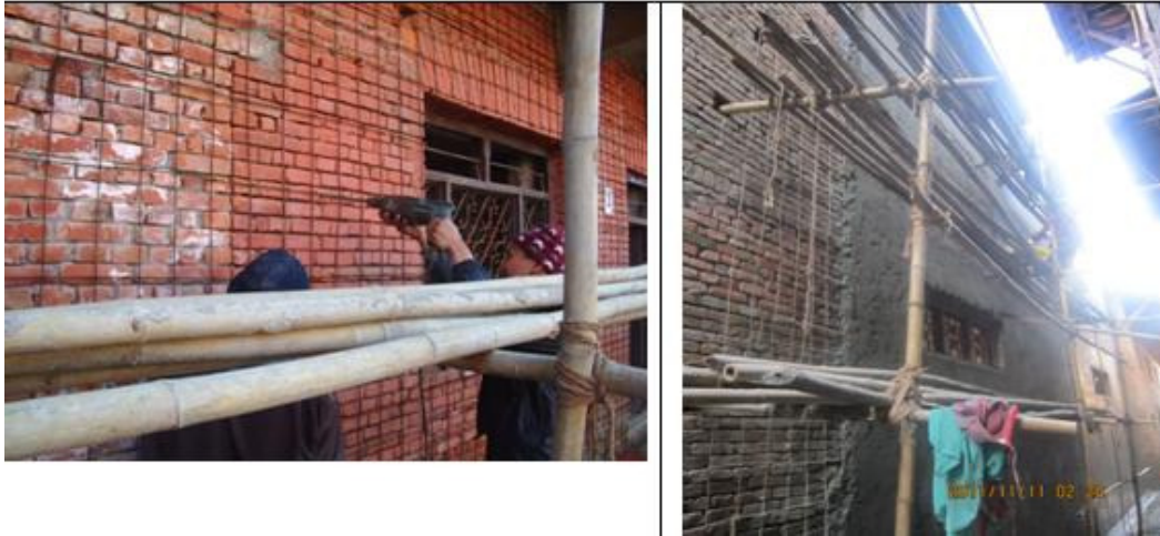
Fig 3.1Retrofitting process using steel wire mesh

includes 1) Removal of plaster from walls in the proposed area for RC jacketing and Bandage/Splint 2) Rake out mortar joints to 15-25 mm depth, clean surfaces and wet with water 3) Excavate the soil for tie beam and lay the reinforcement of tie beam and wall 4) Drill in the wall and provide anchor rod to tie inner and outer steel reinforcement 5) Cast tie beam and apply concrete/plaster in two layers 6) Cure concrete.